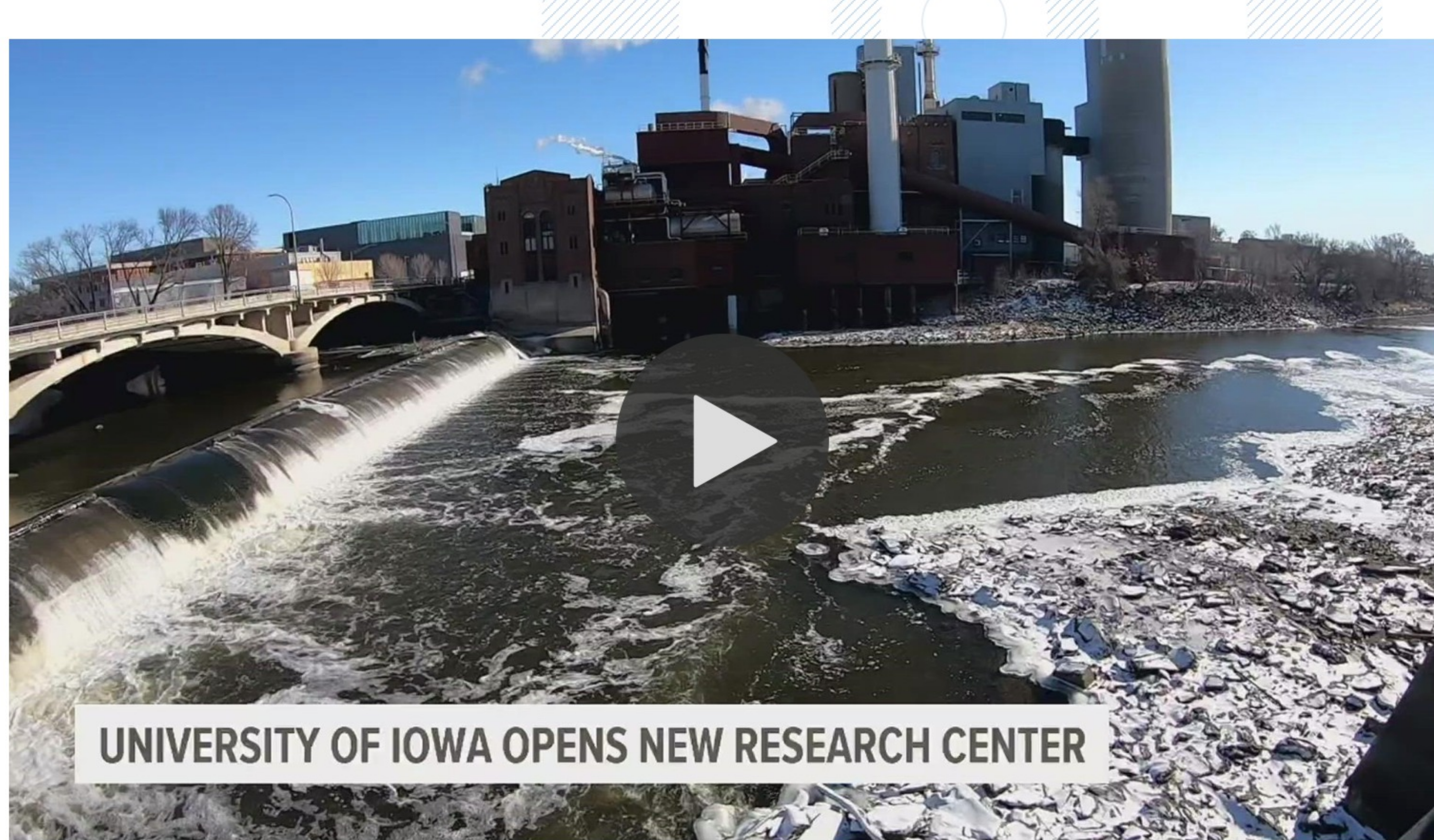
UNIVERSITY OF IOWA OPENS NEW RESEARCH CENTER

The new research center focuses on improving the ability to predict floods and measure potential damages.